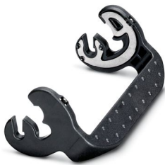
Replacement plastic single locking latch for standard housings of type B16

Please be informed that the data shown in this PDF document is generated from our online catalog. Please find the complete data in the user documentation. Our general terms of use for downloads are valid.